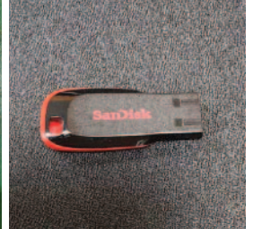
5) USB drive (update) p/n: MMSM0PAC045