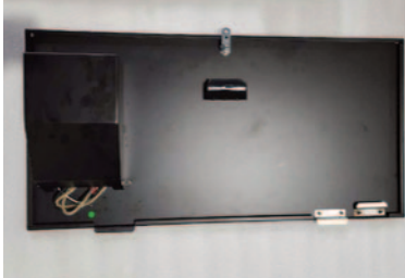
2) Air compressor switch assembly p/n: MMSM0PAC042