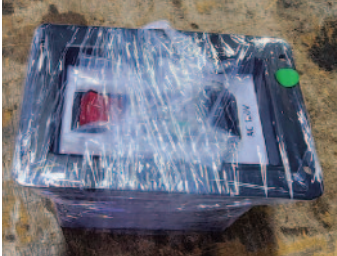
1) Machine switch assembly p/n: MMSM0PAC04