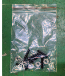
4) Spare bolts & nuts