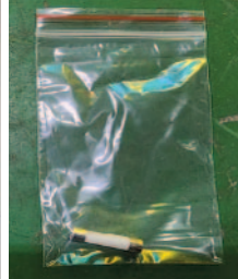
3) Spare fuse