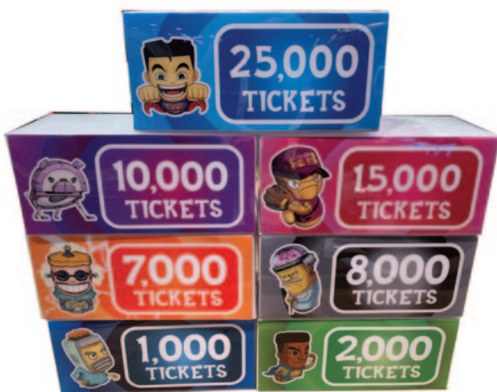
9.125" W. x 4" D. x 4.375" H. ticket boxes (assembly required)