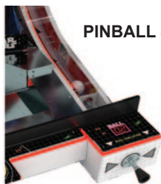
PINBALL SKILL SHOT