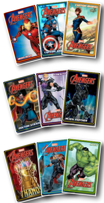
Avengers Series 2 Cards