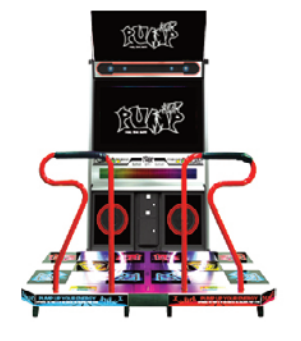
PIU-CX (43" HD display)