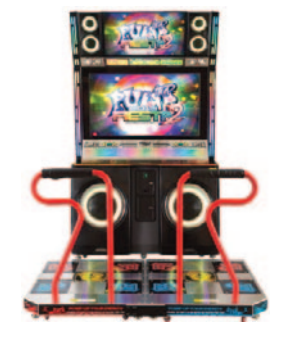
PIU-TX (55" plasma display)