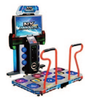
PIU-FX (42" plasma display)

Questions? Please email Andamiro USA's support departments at service@andamirousa.com or parts@andamirousa.com, or call us at (310) 767-5800 and enter 2 for service or 3 for parts, or use our parts/service query form at andamirousa.com. When contacting us about Pump It Up upgrades, please provide the serial number of the game you wish to update. To help expedite your query, please take a photo of the white factory origin and game ID label on the back of the game and the cabinet itself, and send those photos to the Andamiro agent assisting you.