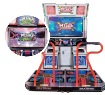
PIU-LX (55" HD display)