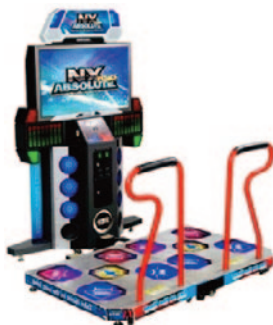
PIU-FX (42" plasma display)

Questions? Please email Andamiro USA's support departments at service@andamirousa.com or parts@andamirousa.com , or call us at (310) 767-5800 and enter 2 for service or 3 for parts, or use our parts/service query form at andamirousa.com . When contacting us about Pump It Up upgrades, please provide the serial number of the game you wish to update. To help expedite your query, please take a photo of the white factory origin and game ID label on the back of the game and the cabinet itself, and send those photos to the Andamiro agent assisting you.