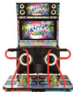
PIU-TX (55" plasma display)