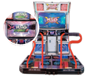
PIU-LX (55" HD display)