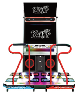
PIU-CX (43" HD display)