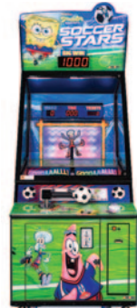
SPONGEBOB SOCCER STARS Lic. Nickelodeon Intro: 2018 (ret.)