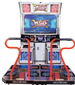
PUMP IT UP LX Ships with XX software