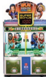
SUPER STAR FOOTBALL COINS Lic. NFLPA Intro: 2017 (ret.)