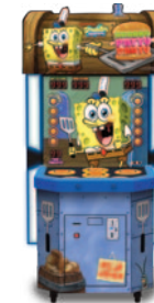
KRABBY PATTY PARTY Lic. Nickelodeon Intro: 2016 (ret.)