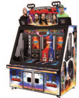
SUPERSTAR RUMBLE Lic. WWE Intro: 2018 (ret.)

ANDAMIRO'S LICENSED ARCADE GAMES ARE PLACED IN THOUSANDS OF ENTERTAINMENT FACILITIES NATIONALLY AND INTERNATIONALLY. IN HIGH-TRAFFIC LOCATIONS, A SINGLE GAME CAN GENERATE AS MANY AS 100,000 ENGAGEMENTS ANNUALLY*