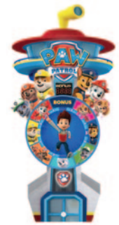
PAW PATOL SPINNER Lic. Nickelodeon Intro: 2017 (ret.)