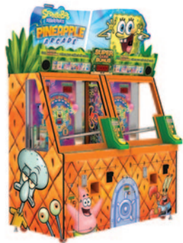
SPONGEBOB PINEAPPLE ARCADE Lic. Nickelodeon Intro: 2015 (ret.)