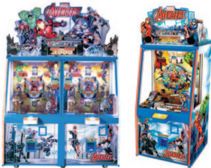
AVENGERS COIN PUSHERS » Flagship model: 2-player card » Variations by special order: 2P non-card, 1P card and 1P non-card

TARGET AUDIENCES: KIDS, TEENS & ADULTS 6-80+