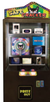
SAFE CRACKER Skill merchandiser