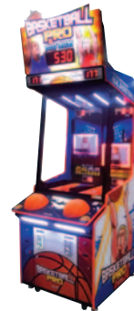
BASKETBALL PRO » Ticket redemption » Fun version (DBA)