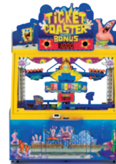
TICKET COASTER Lic. Nickelodeon Intro: 2021