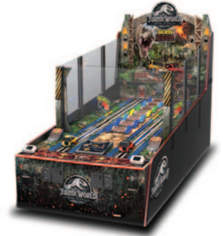
JURASSIC WORLD: FALLEN KINGDOM » Original long-track model (9'9" deep) » New MINI short-track model (6'2" deep)