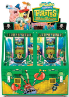
SPONGEBOB PIRATES OF BIKINI BOTTOM Lic. Nickelodeon Intro: 2022