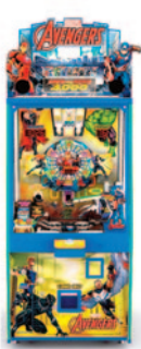
AVENGERS PUSHERS (2- and 1-Player Cabinets) Lic. Marvel (Disney) Intro: 2020