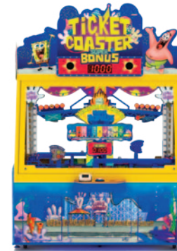
SPONGEBOB TICKET COASTER