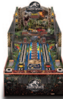
JURASSIC WORLD (Original and Mini) Lic. Universal Intros: 2020 and 2022 (Mini)