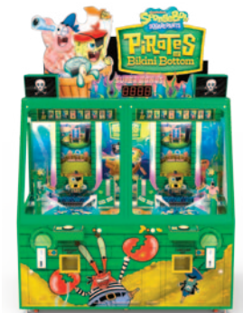
SPONGEBOB PIRATES OF BIKINI BOTTOM