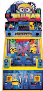
DESPICABLE ME JELLY LAB Lic. Universal Intro: 2017 (ret.)